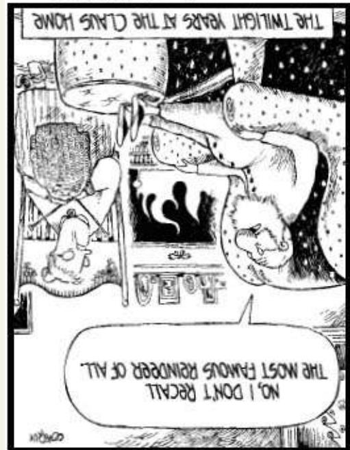
SPEED BUMP by Dave Coverly

from JoyfulNoiseletter.com © Dave Coverly Reprinted with permission