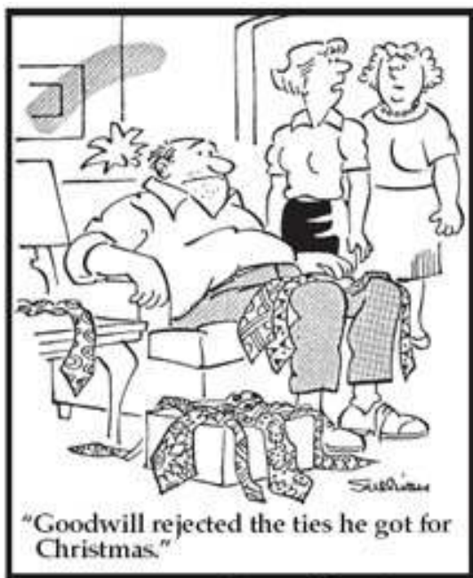
from JoyfulNoiseletter.com