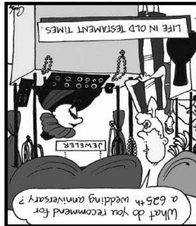
Inherit the Mirth by Cuyler Black

from JoyfulNoiseletter.com ©Cuyler Black Reprinted with permission